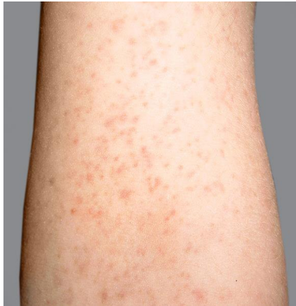
Figure 1. Haemorrhagic rash on upper limb