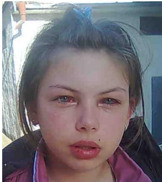
Figure 2. Oedematous and turgescence facies, conjunctival ecchymosis and eyelids haematomas

The medical condition manifests with deteriorated condition of the child, septic fever for 5 days, oedematous and turgescence facies, generalized lymphadenopathy and significant hepatosplenomegaly. The liver and spleen are palpated 3 cm below the rib arch with an elastic consistency, painless. On admission to the clinic the child was without clinical evidence of pneumonia, with BP 26/min, HR 110/min, BP 115/70. The clinical presentation is enriched with breathing difficulty, coughing and orthopnoic position, arterial hypertension up to 160/110 mm Hg, macroscopic haematuria, moderate proteinuria, oliguria(0,5ml/kg/h) and acute renal failure which symptoms are in the context of acute nephritic syndrome. There is a history for several tick bites and a contact with