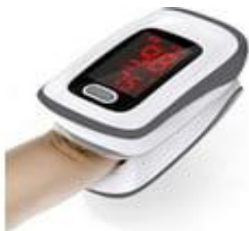
Figure 1. Fingertip Pulse Oximeter

non-invasive measurement of arterial blood oxygen saturation (SpO 2 ), pulse rate, and pulse intensity. Data are presented via a high-contrast digital LED display, allowing for rapid visualisation ( Figure 1 ).