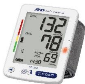
Figure 2. Oscillometric Non-Invasive Blood Pressure

The device delivers accurate and reproducible measurements within an 8 to 10-second interval. It incorporates a dynamic pulse bar graph, which facilitates real-time hemodynamic monitoring. In addition, we employed the A&D Medical Oscillometric Non-Invasive Blood Pressure and Pulse (NIBP) Monitor, a highly reliable device designed for precise measurement of systolic and diastolic blood pressure, as well as heart rate (beats per minute). This model demonstrated the highest measurement fidelity, with deviations limited to \pm 1 mmHg from reference standards ( Figure 2 ). The system is equipped with advanced functionalities including irregular heartbeat detection, three-reading averaging, and Bluetooth connectivity, enabling seamless integration with multiple health monitoring applications. To assess and analyse Mental and Spiritual Wellness by emotional states, we recorded changes in oxygen saturation levels, body and room temperature, blood pressure (systolic and diastolic), pulse rate, and indicators of physical and psychological self-perception. Correlation analysis was conducted to reveal the interdependencies among these variables. The study aim was by analysing the